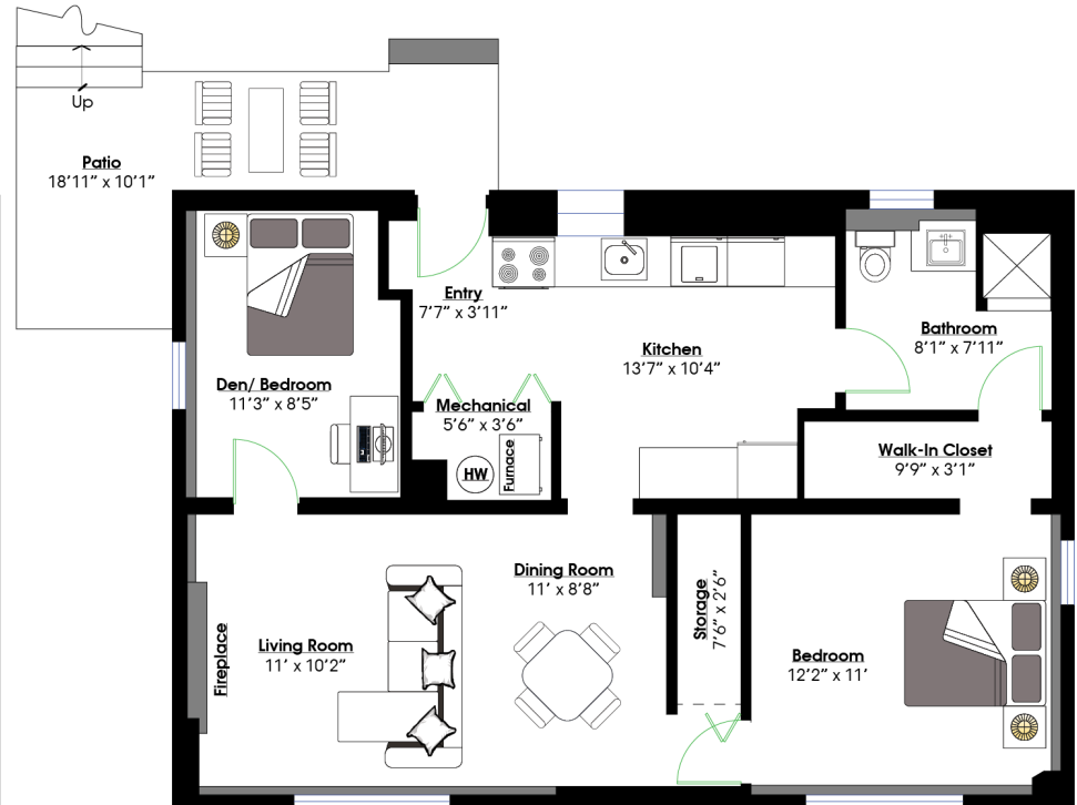
LOWER LEVEL Floor Area: 858 Sq. Ft. Ceiling Height: 7'2"

Layout by BC Floorplans. ** While all reasonable attempts have been made to ensure accuracy and the square footage and room dimensions are believed to be correct to ANSI Standards, due to the possibility of human error the information cannot be guaranteed. ESO Insured for $1,000,000. Information should not be relied upon without independent verification.