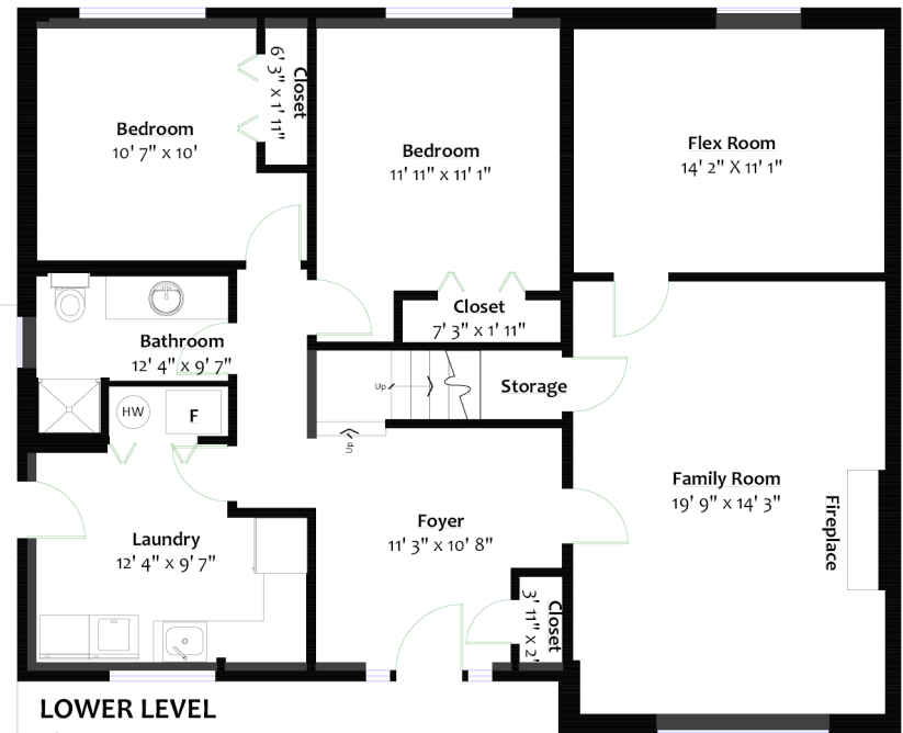
LOWER LEVEL Floor Area: 1,270 Sq. Ft.

Sq/ft & room measurements are approx. based on interior measurements to exterior walls. By BC Floorplans. Information should not be relied upon without independent verification. This communication is not intended to cause or induce breach of an existing agency agreement.