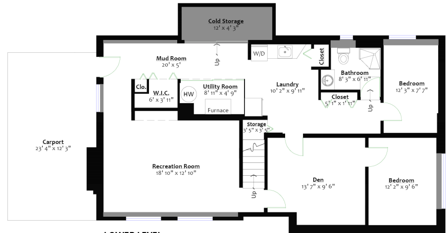
LOWER LEVEL Floor Area: 1,337 Sq. Ft. Ceiling Height: 7' 4"

Layout by BC Floorplans. E&O Insured for $1,000,000 While all reasonable attempts have been made to ensure accuracy and the square footage and room dimensions are believed to be correct to ANSI Standards, due to the possibility of human error the information cannot be guaranteed. Information should not be relied upon without independent verification. This communication is not intended to cause or induce breach of an existing agency agreement.