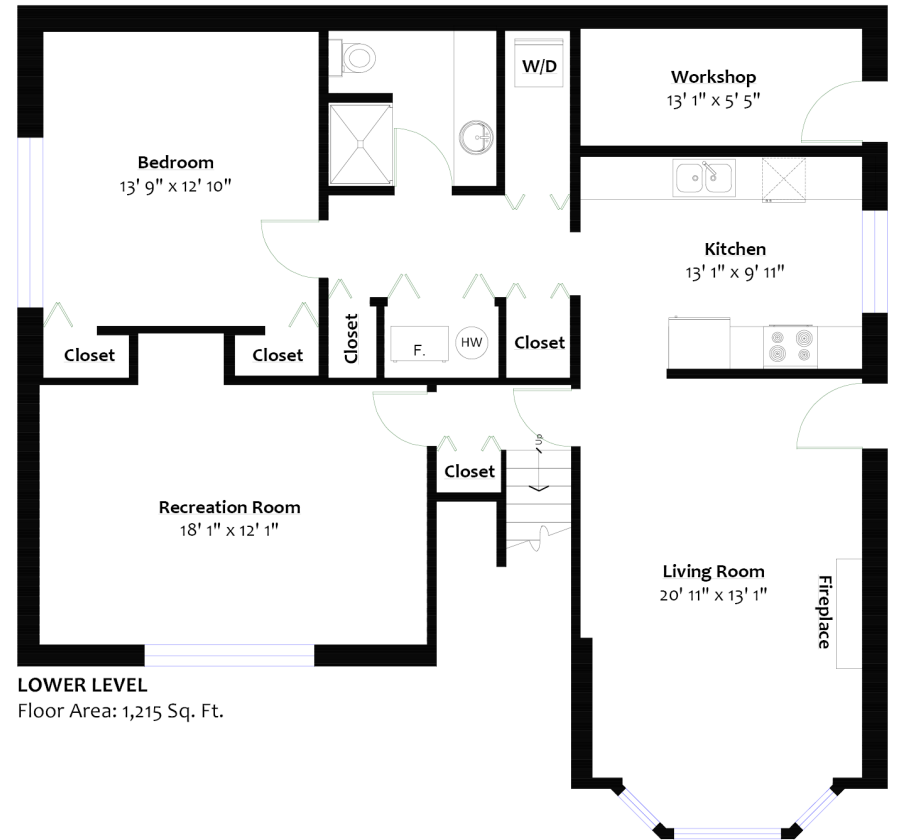
LOWER LEVEL Floor Area: 1,215 Sq. Ft.